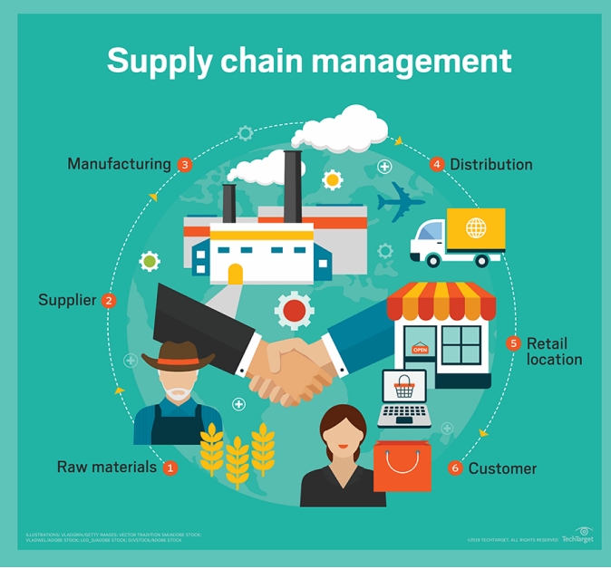
*Figure:2-Image of Supply Chain Management(SCM)

Supply chain management maintains the balance between the demand and supply and involves activities right from procurement of materials and converting them into finished goods to ensuring delivery at the right time to reach the end-consumer. Hence, supply chain management is the lifeline of an organization. It needs to be really efficient to keep the operations running like a well-oiled machine. A streamlined supply chain management chain can enhance customer relationship, lower down operational costs.